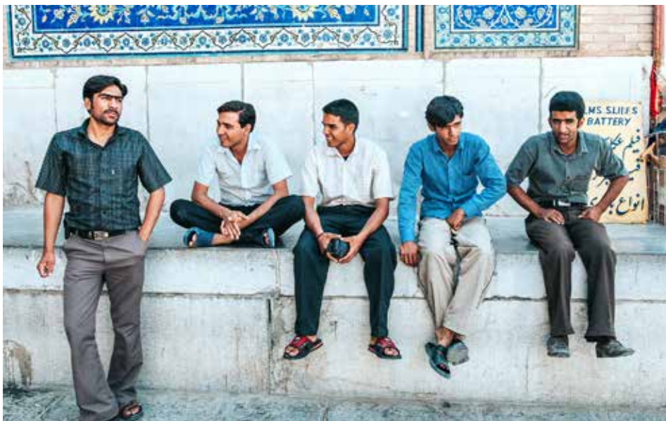
Young Iranians hang out outside a mosque. New believers must discover a new identity as members of the body of Christ.