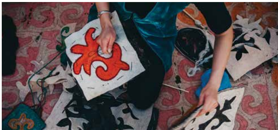
A seamstress works on traditional Kyrgyz patterns in Kyrgyzstan. Central Asian cultures value tradition, and many new believers face persecution for leaving their religious tradition.

No one wants to be the first to stray from their family beliefs. Those who