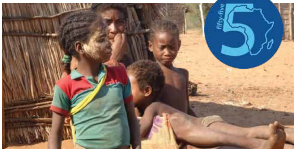
Children wear traditional sunscreen in the area where the Malagasy doctor visits for church planting and medical clinics.

Years ago, I traveled alongside Malagasy pastors to numerous villages making plans for planting churches, but before the work was complete, the Lord changed my direction and called me to another work. As the Malagasy pastors set goals to keep working, I knew it would be extremely difficult for them to reach certain geographical areas, but I kept praying for God to send more workers.