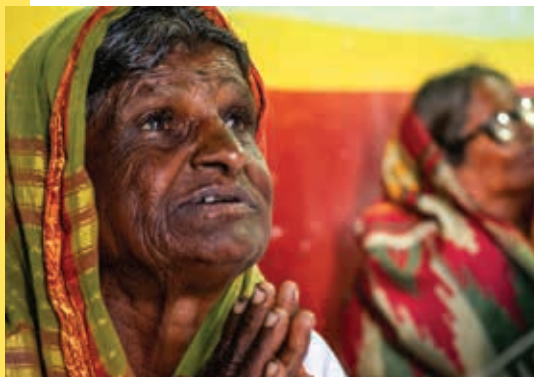
An Indian woman prays during a church service.