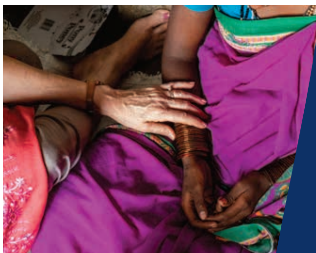
A Christian worker prays for a South Asian woman.

While much of the world shut down during COVID-19, workers partnered with the church in South Asia to provide physical and spiritual help to millions in need. As believers helped meet people's physical needs, they shared about the love of Jesus Christ and the eternal hope, peace, and salvation found only in Him. Idols and false gods remained silent to South Asians' pleas for help. But through the sacrificial love of the believers involved with the relief projects, many saw the one, true God for the first time. God provided South Asians with access to the gospel through COVID-19 relief efforts. He opened their hearts to hear and believe the good news. Churches have been planted and many people, once in darkness, now live in the light with a sure