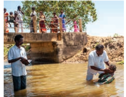
A new believer is baptized in a local river after a Sunday morning service at a village church.

In Mumbai, India, a city of over 20 million people, the harvest is plentiful. Believers regularly go out by train, bus, car, rickshaw, and foot, seeking the lost and sharing the gospel. In the past year, believers started 25 Bible studies in and around Mumbai's red-light district. In another area of the city, six discipleship groups formed. In a modern, progressive area of the city where many professionals live, a church was planted. During COVID-19 lockdowns, believers saw God draw people to Himself in amazing ways and plant churches in homes all over the city. They learned new ways to communicate with technology and now use technology for gospel seed-sowing and discipleship. Praise God for moving in Mumbai!