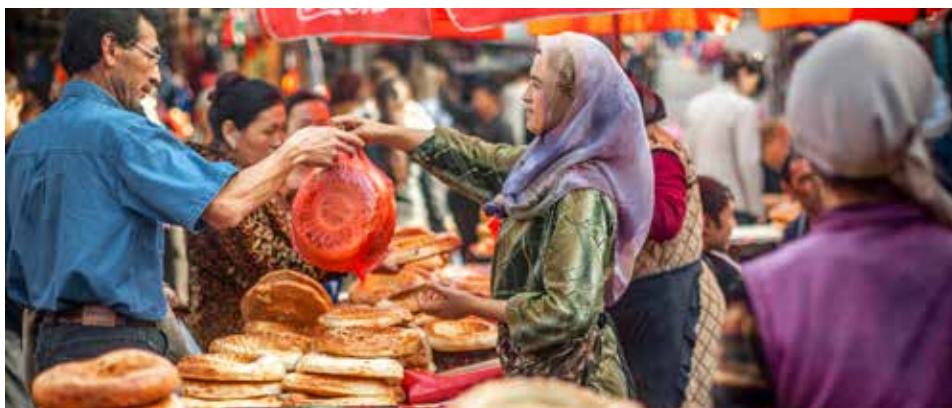
The outdoor bazaar in Osh, Kyrgyzstan.