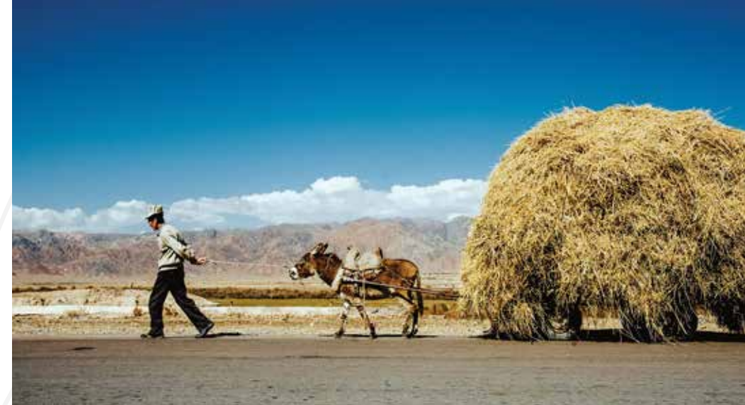
A farmer brings in hay from his field along a highway in Kyrgyzstan. The highway follows the historic Silk Road trading route.

23 DUNGAN. Please pray for a believer who is dealing with spiritual attacks at work. It seems that some people are truly trying to harm him. Pray that he will call on the name of Jesus for protection and be bold in sharing his faith with