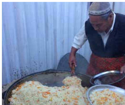
A Dungan man cooking rice.

In time, the Dungan people established themselves in Central Asia and flourished. They developed a reputation for making money. Today, in addition to farming, many Dungan dominate the business world. Others make good wages as long-haul truck drivers. Dungan cafes serving Chinese hot pot