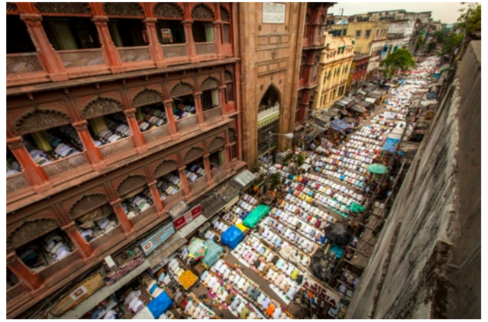
Muslim men kneel during one of the five daily calls to prayer in Kolkata, India.

"He has no need, like those high priests, to offer sacrifices daily, first for his own sins and then for those of the people, since he did this once for all when he offered up himself.