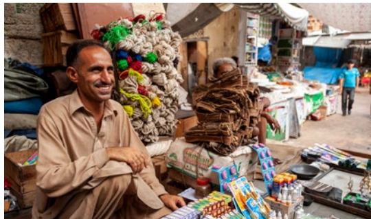
A Pakistani vendor at the Empress Market in Karachi, Pakistan.

The Bible speaks of eyes that see yet cannot perceive, ears that hear, yet do not understand (Isaiah 6:9-10; Mark 4:11-12). These realities were judgments on Israel, fulfilled in their rejection of the Savior. Yet, they also describe the spiritual reality of countless millions in South Asia and around the world where the god of this age has blinded the minds of unbelievers (2 Corinthians 4:4). Left to themselves they cannot see; their ears are deaf to