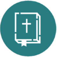
Preaching & Teaching