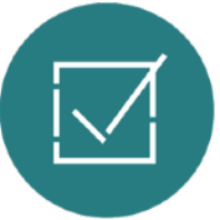
Accountability & Discipline