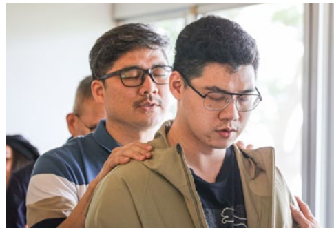
Baptist leaders pray for Taiwanese who responded to God’s call for them to go.

Lingtou is a Baptist retreat center once owned by the IMB and later donated to Taiwan Baptists. Dormant for many