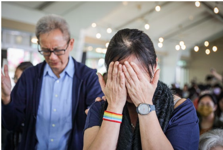
Next Generation Taiwanese responding to the call to reach the nations.

The Taiwan Baptist Convention is a light to the nations with church planting and missionary sending goals but with hundreds of Taiwanese pastors set to retire in the next 10 years, who will go? Answering the call, 1-2-3 Next Generation is a 2-year leadership development program in partnership with New Orleans Baptist Theological Seminary. Laying a biblical foundation, participants attend several 3-day courses each quarter. They are mentored in hands-on ministry. After graduating they join a church planting team, become a pastoral intern, or apply for cross-cultural missions. Please pray for these students and that the light will continue to shine bright from Taiwan.