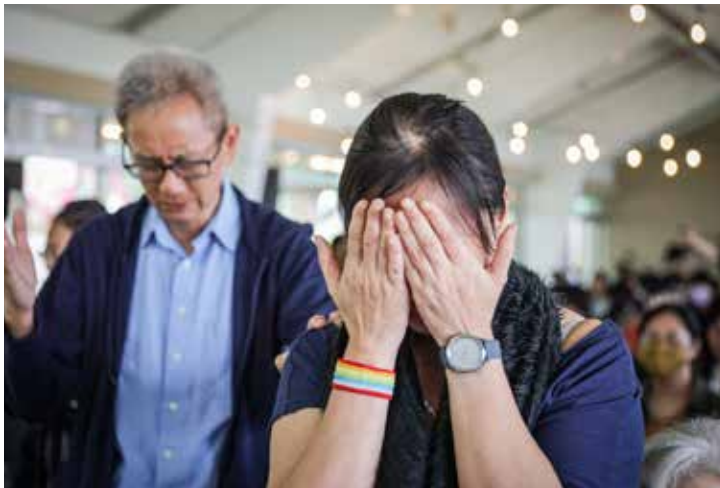
Next Generation Taiwanese responding to the call to reach the nations.

The Taiwan Baptist Convention is a light to the nations with church planting and missionary sending goals but with hundreds of Taiwanese pastors set to retire in the next 10 years, who will go? Answering the call, 1-2-3 Next Generation is a 2-year leadership development program in partnership with New Orleans Baptist Theological Seminary. Laying a biblical foundation, participants attend several 3-day courses each quarter. They are mentored in hands-on ministry. After graduating they join a church planting team, become a pastoral intern, or apply for cross-cultural missions. Please pray for these students and that the light will continue to shine bright from Taiwan.