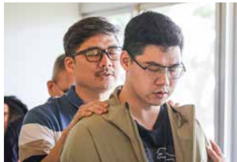
Baptist leaders pray for Taiwanese who responded to God’s call for them to go.

Lingtou is a Baptist retreat center once owned by the IMB and later donated to Taiwan Baptists. Dormant for many