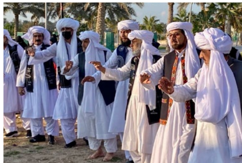
Baloch men wearing traditional clothes perform a traditional dance.

Amid such turmoil, most Baloch are Muslims. They pray five times a day, listen to the Quran in Arabic (a language they don’t understand), and seek a god who is silent and unreachable. Most Baloch people will die having never heard the gospel.