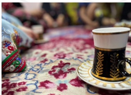
Baloch love to spend time with one another while drinking tea and talking about their families.

4 Iranian Baloch live in a society full of hopelessness. They face joblessness, drug addiction, and a strict government. In such desperate times, there has been a rise of suicide among the youth. Pray that Iranian Baloch will be rescued by the light of Jesus.