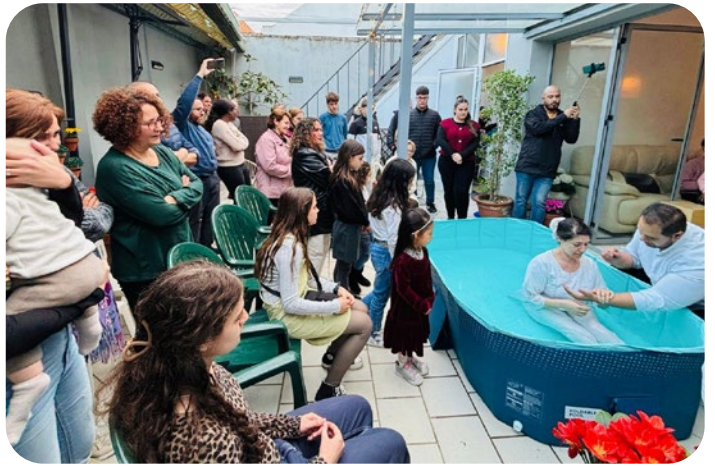
A believer is baptized in Seville, Spain.