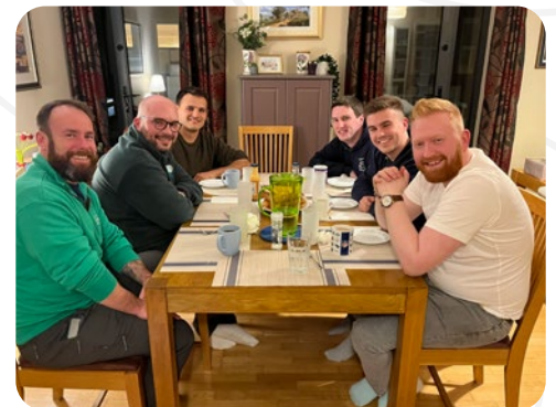
Baptist college mission team in the Republic of Ireland.

31 OSLO, NORWAY. A team in Oslo is hosting volunteers. Pray for effective ministry that leads to long-term spiritual growth. Pray that gospel seeds planted will take root in receptive hearts, bringing people to Christ and into faithful Christian community.