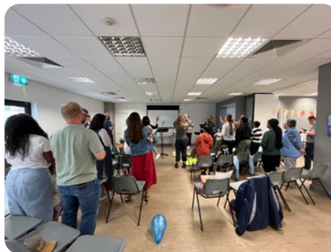
North City Baptist Church in the Republic of Ireland.