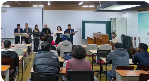
Koreans ministering to international migrant workers lead a worship service and pray for their requests, this is after teaching them the Korean language.

Many are from areas in Asia that consist of unreached people groups (UPGs) and unengaged, unreached people groups (UUPGs). While a few churches are ministering to these migrants, missionaries and local partners want to help local leadership get training in discipleship and church planting as they minister to the migrants. Recently, by God's providence, a vital connection was made with a training center in an area where many of these migrants are from. Missionaries are working to link this training center with the local partners so that a team can come to the southeast region and equip leaders to effectively reach the migrants. Please pray for this.