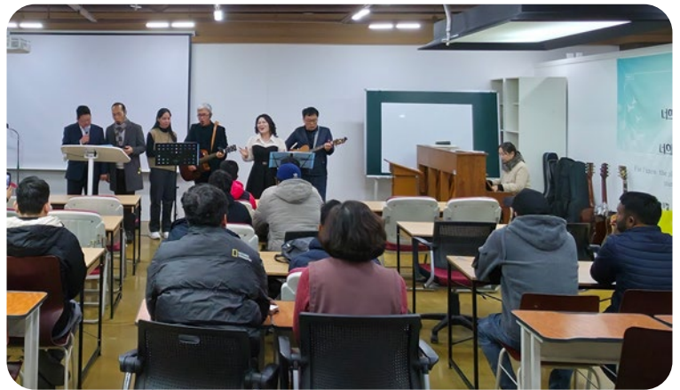
Koreans ministering to international migrant workers lead a worship service and pray for their requests. The migrant workers receive teaching in Korean, their heart language.

Many are from areas in Asia that consist of unreached people groups (UPGs) and unengaged, unreached people groups (UUPGs). While a few churches are ministering to these migrants, missionaries and local partners want to help local leadership get training in discipleship and church planting as they minister to the migrants. Recently, by God's providence, a vital connection was made with a training center in an area where many of these migrants are from. Missionaries are working to link this training center with the local partners so that a team can come to the southeast region and equip leaders to effectively reach the migrants. Please pray for this.