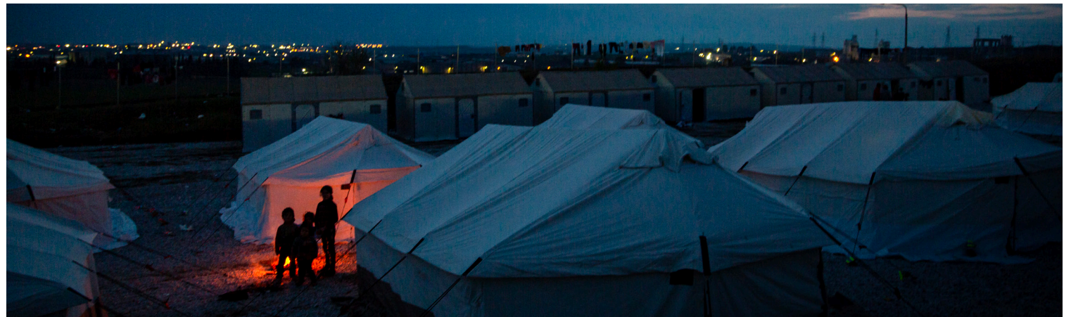
A migrant camp in Greece is one of several temporary camps where migrants receive housing and food while their status is determined.